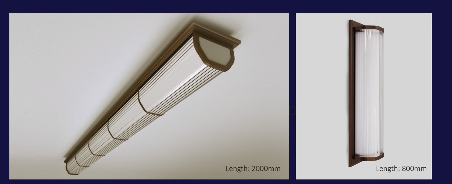
DESIGNED ARCHITECTURAL LIGHTING www.dal-uk.com